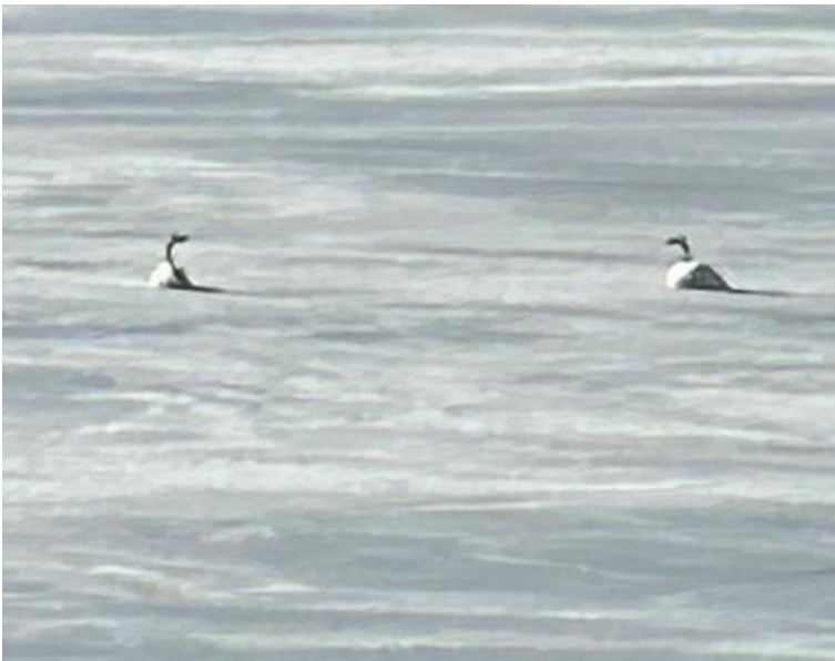
Swans on the ice at DHL February 5, 2024