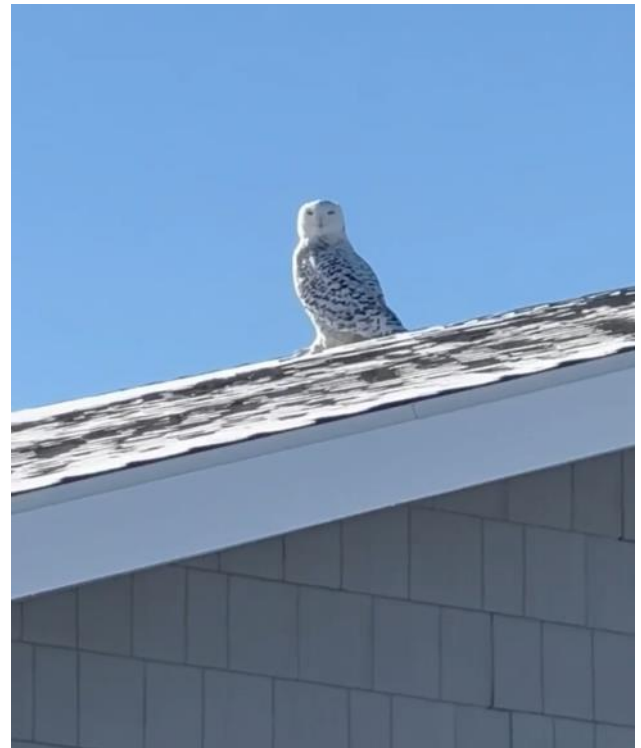
A visit from a Snowy Owl at a home on DHL.